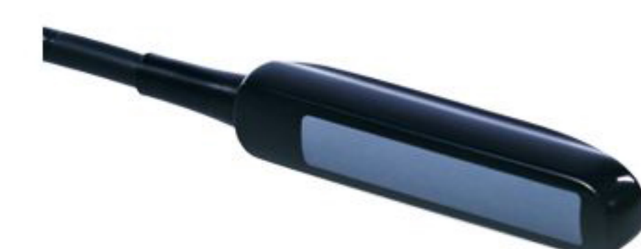
6.5MHz multi-frequency linear rectal probe