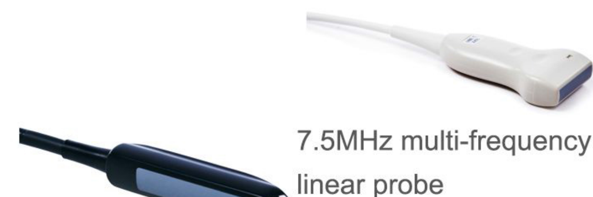
7.5MHz multi-frequency linear probe